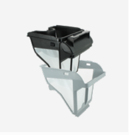
Filter canister Dual stage filter: 150/60 µ